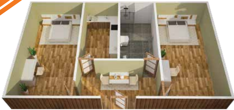
2 BHK HOME