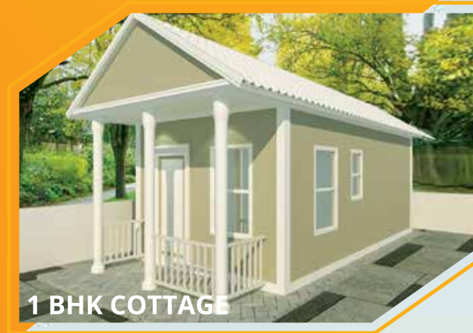
1 BHK COTTAGE

COZY MODULAR HOMES designs flat-pack modular homes and container homes. These are manufactured using a robust steel frame, corner posts, and interchangeable wall panels. All components required for installation and connection are bundled into one easily transportable and very affordable unit.