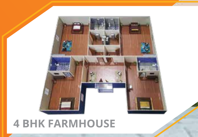
4 BHK FARMHOUSE