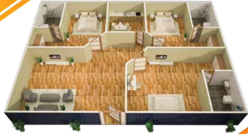
3 BHK HOME