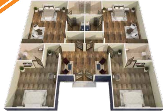
4 BHK HOME